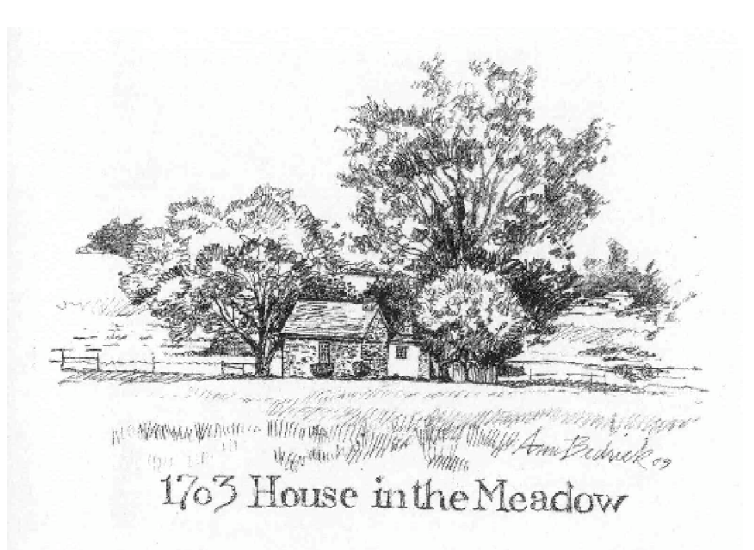
The drawing of the House in the Meadow was created by Ann Bedrick for the Chester County Historic Preservation Network.