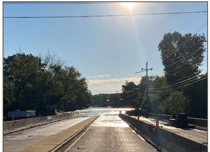
The day after the storm the Route 1 Bridge in Chadds Ford shows water as far as the eye can see. For location reference - Brandywine River Museum and Leader Sunoco are on the right. Hanks is on the left.

Recent years have brought significant flooding: 1972—16.56', 1999—17.9', 2011—15.23', 2014—16.05', but Ida has the record! •