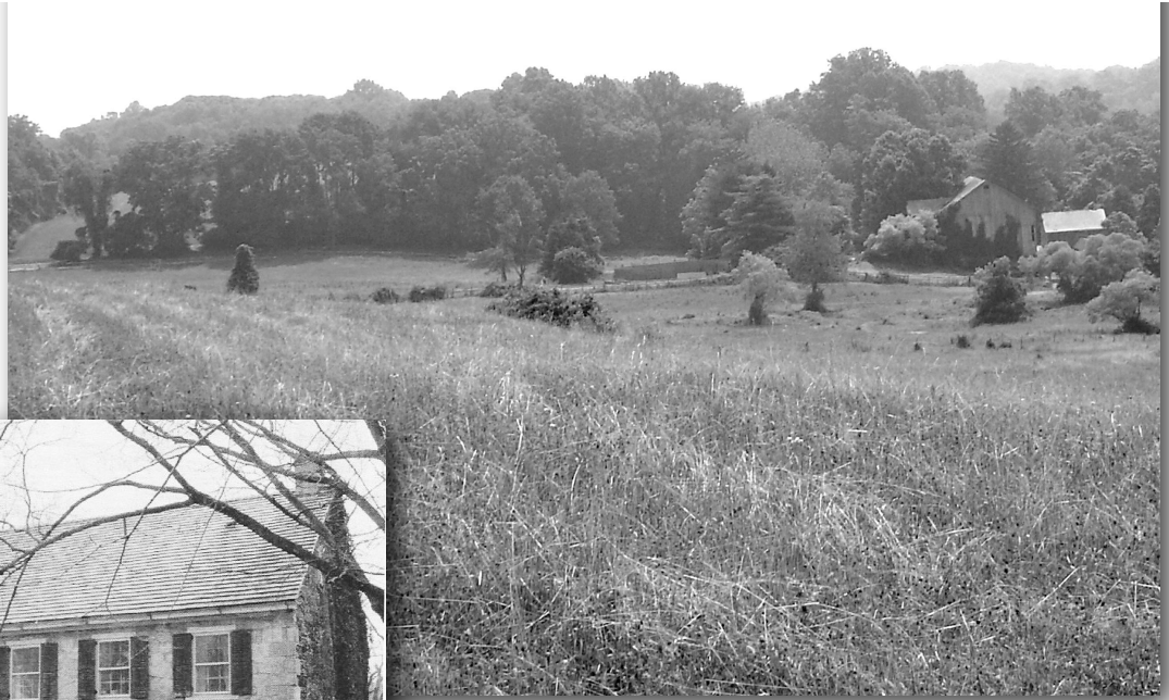
Right: The view from Hillendale Road Below: The farmhouse